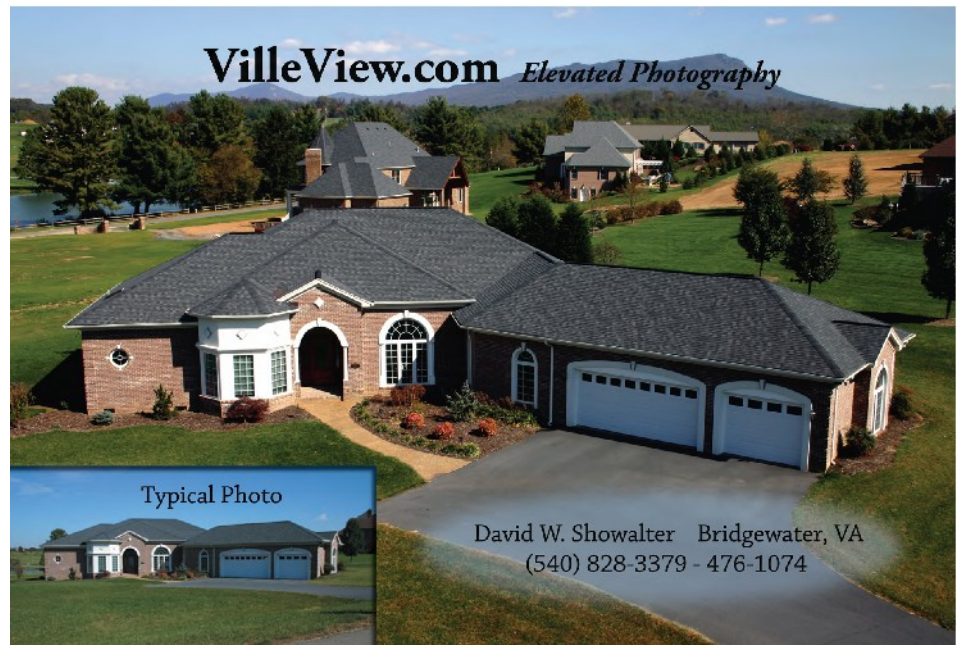
Photo tips for special events-

Remember, shop for your banking services the same way you shop for anything else – take your time, comparison shop, and get picky. Know what they're really charging. Read the fine print. Ask questions and expect straightforward answers. After all, it's YOUR money!